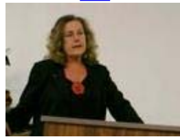
Best of NLN - 2007