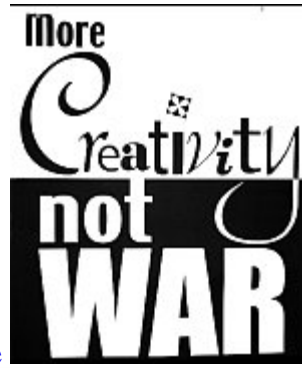
War Resisters League