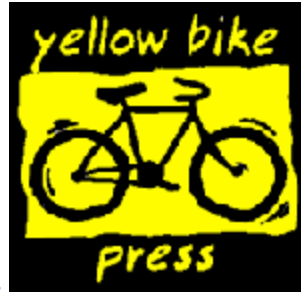
Yellow Bike Press